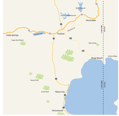
As of January 2018, the MHC represents the above geographic focus. The MHC is open to expanding the geographic scope of its work in the future where appropriate.

Locals are struggling to find housing in our community - with estimates showing a shortfall of more than 12,000 units to serve the local workforce.